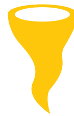
A devastating tornado

Municipalities work hard to minimize their exposure to these events. But the fact remains that the best planning and the most conscientious attention to public safety cannot guarantee that a municipality will weather such events without significant physical damage, major disruption to services and/or human trauma.