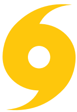
A powerful hurricane

These are the kinds of events that every public official dreads, the crises that transform peaceful, productive residents into frightened, frustrated or angry victims: