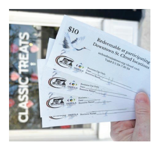
▲ Customers could purchase $10 downtown shopping vouchers for $5.