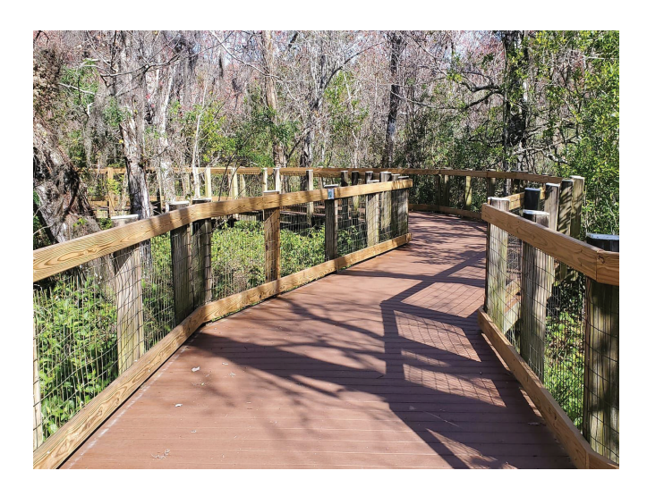
▲ The Preserve includes a boardwalk to Lake Apopka.

summer camps. The Preserve also provides scout troops with a location to work on badges and has hosted Eagle Scout projects and a Girl Scout Bronze project. It partnered with a local foundation to administer the Youth Climate Project. That project challenges high school seniors to learn about the role climate change will play in Florida's future and consider innovative ways to resolve its effects. Also, seven scholarship recipients in 2023 received $20,000 in scholarship funds from the Preserve.