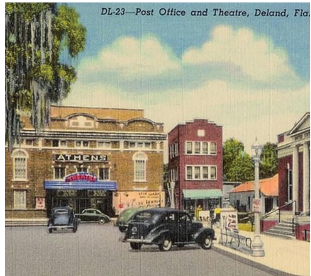
◆ Postcard looks west on Indiana Avenue toward the historic Athens Theatre, with the post office on the right.