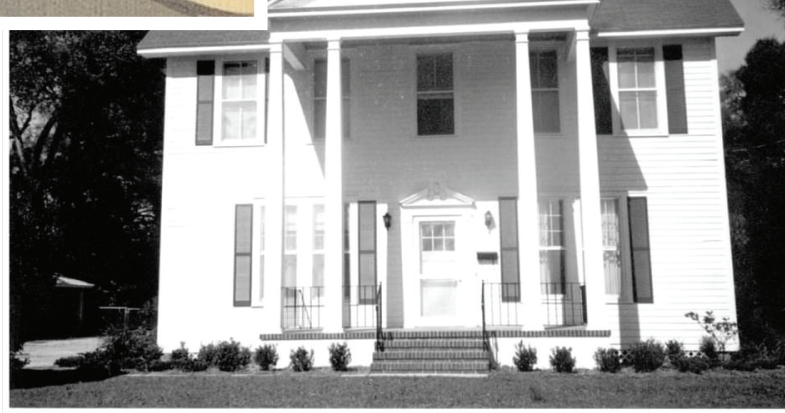
▶ The Kilkoff House, built in 1878, is one of the oldest homes in the DeLand area.