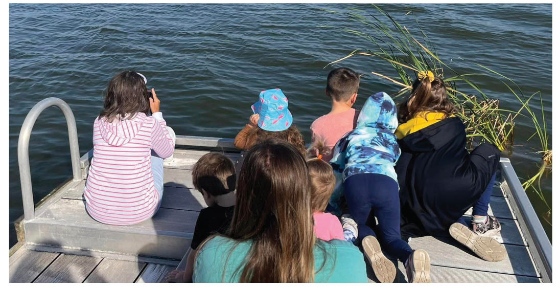
▲ Summer camps are held at the Preserve.

of land in the Town, and its environmental education and outreach programs are predicted to benefit the community as residential development increases.