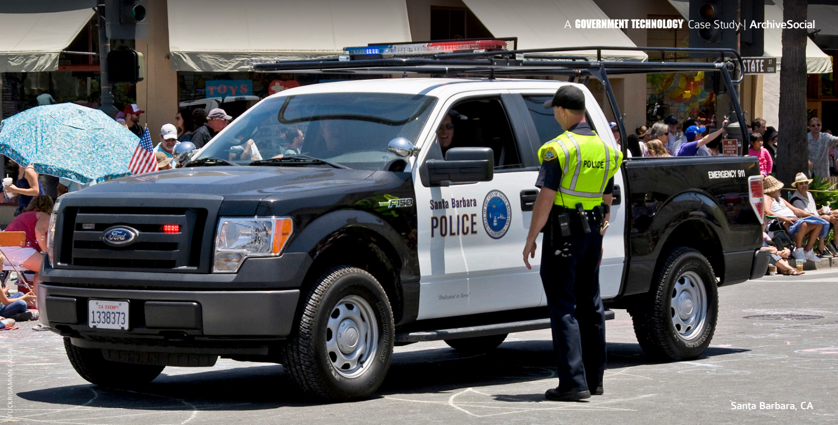
Santa Barbara, CA