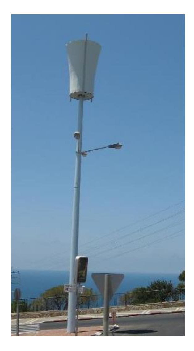
Exhibit 8 . The antenna is wider than, and out-of-scale to the pole. This design is prohibited.