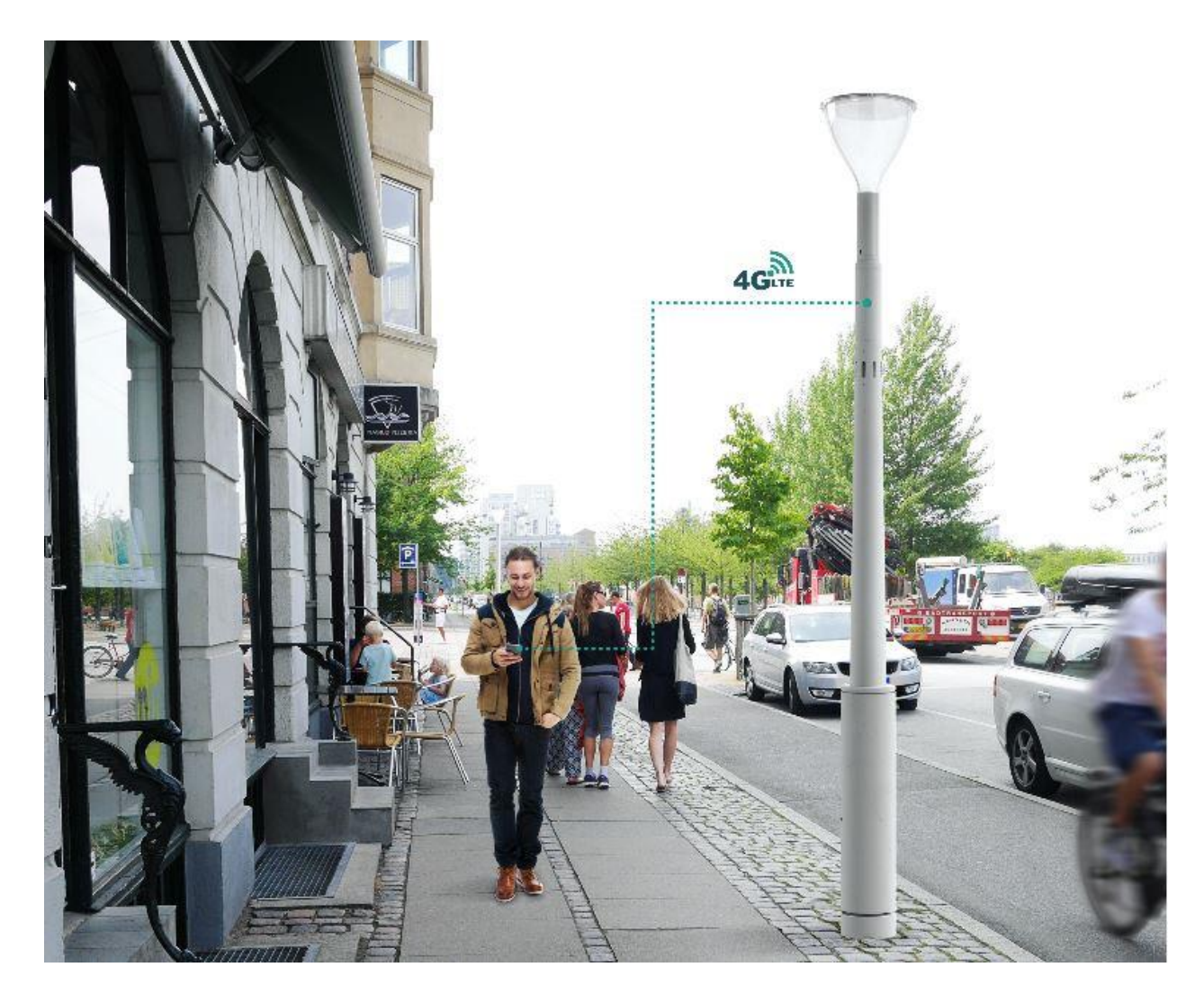
Exhibit 3. An antenna incorporated into, and hidden in the pole of top mounted, pedestrian scaled light may be acceptable if painted black, featured an acorn luminaire, and otherwise substantially resembled the acorn light fixtures already existing in the City. The photo depicts a Philips pole with internal Ericsson antennas.