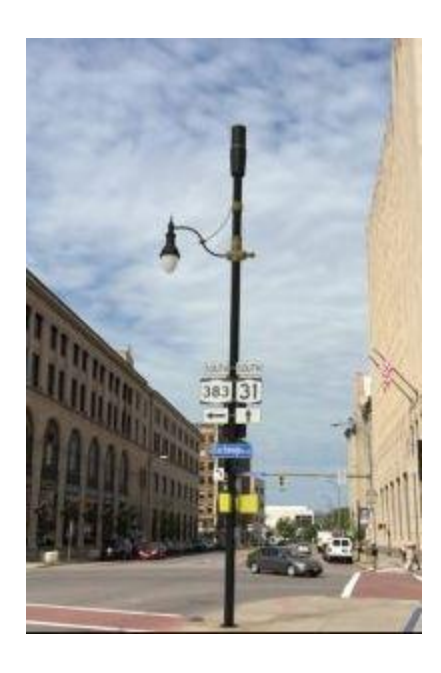
Exhibit 12 . The pole lacks a base in scale to the volume of the antenna, which is larger than the diameter of the pole and does not appear to be an original part of the pole. This design would be prohibited.