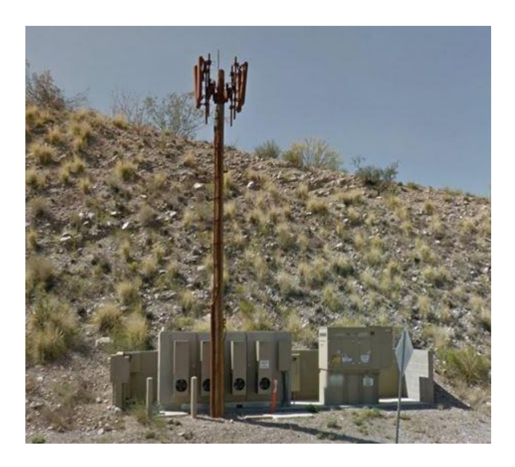
Exhibit 11. Antennas on arms are prohibited.