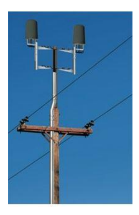
Exhibit 6. Wireless facilities over, or within 20 feet of energized wires are prohibited.