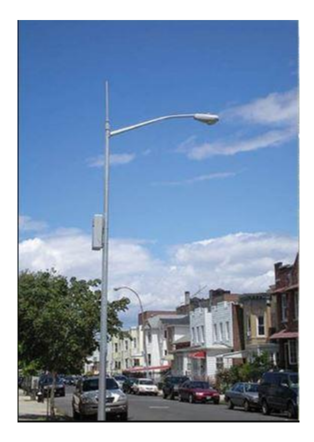
Exhibit 2 . The antenna is narrower than, and in scale with the pole. This may be an acceptable design for a cobra-style light fixture; however, the City is transitioning from cobra lights to decorative lights. The applicant would need to remove its wireless facility within 30 days upon notice that the city will replace the light pole and fixture.