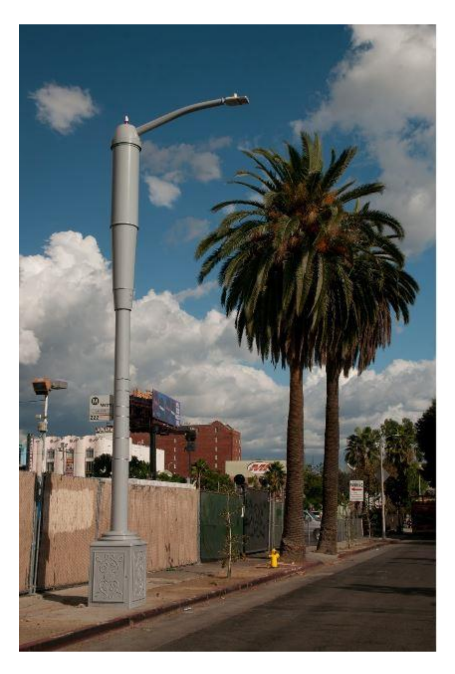
Exhibit 7. The antenna enclosure has a larger diameter than the pole, rendering it insufficiently cloaked. This design is prohibited.