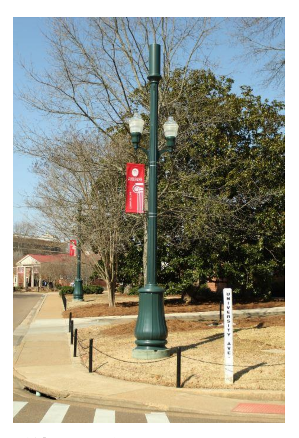
Exhibit 5. The base is out-of-scale to the arms and luninaires. In addition, while symmetrical, the pole and antenna extend far above the luminaires, making the design appear vertically out of proportion. Arms and luminaries should be within the top 20% of the pole height. This design is prohibited; however, a similar design may be acceptable with appropriate modifications.