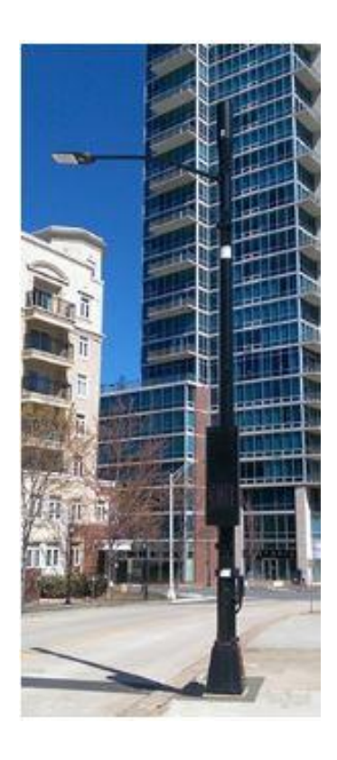
Exhibit 4. The antenna, by Valmont, is painted black to blend-in with the pole and is in scale with the pole base. The arm is within the top 15-20% of the pole height, appearing in balance. This may be an acceptable design if the pole otherwise resembled the city's decorative pole features.