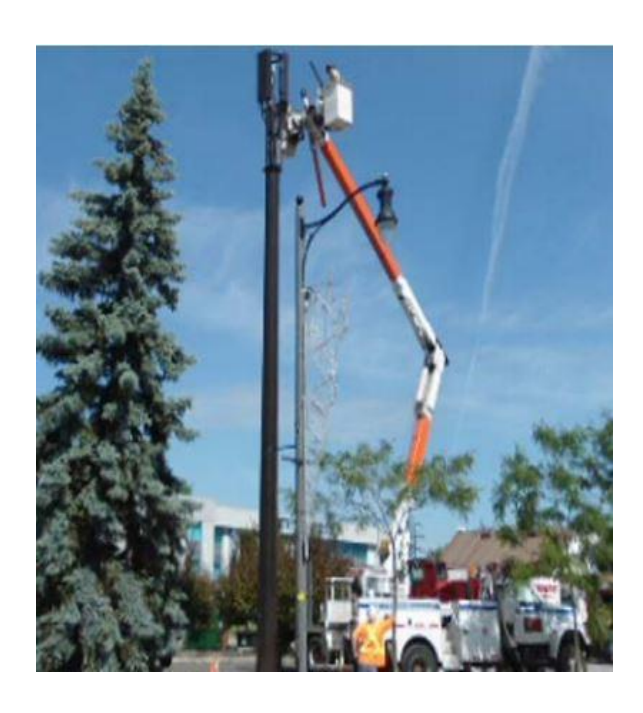
Exhibit 14. The location context for this small cell monopole is not reasonable because it creates a cluttered appearance. In addition, the antenna is larger than the diameter of the pole, lacks of pole base of comparable volume, and is vertically out-of-scale to the existing streetlights.