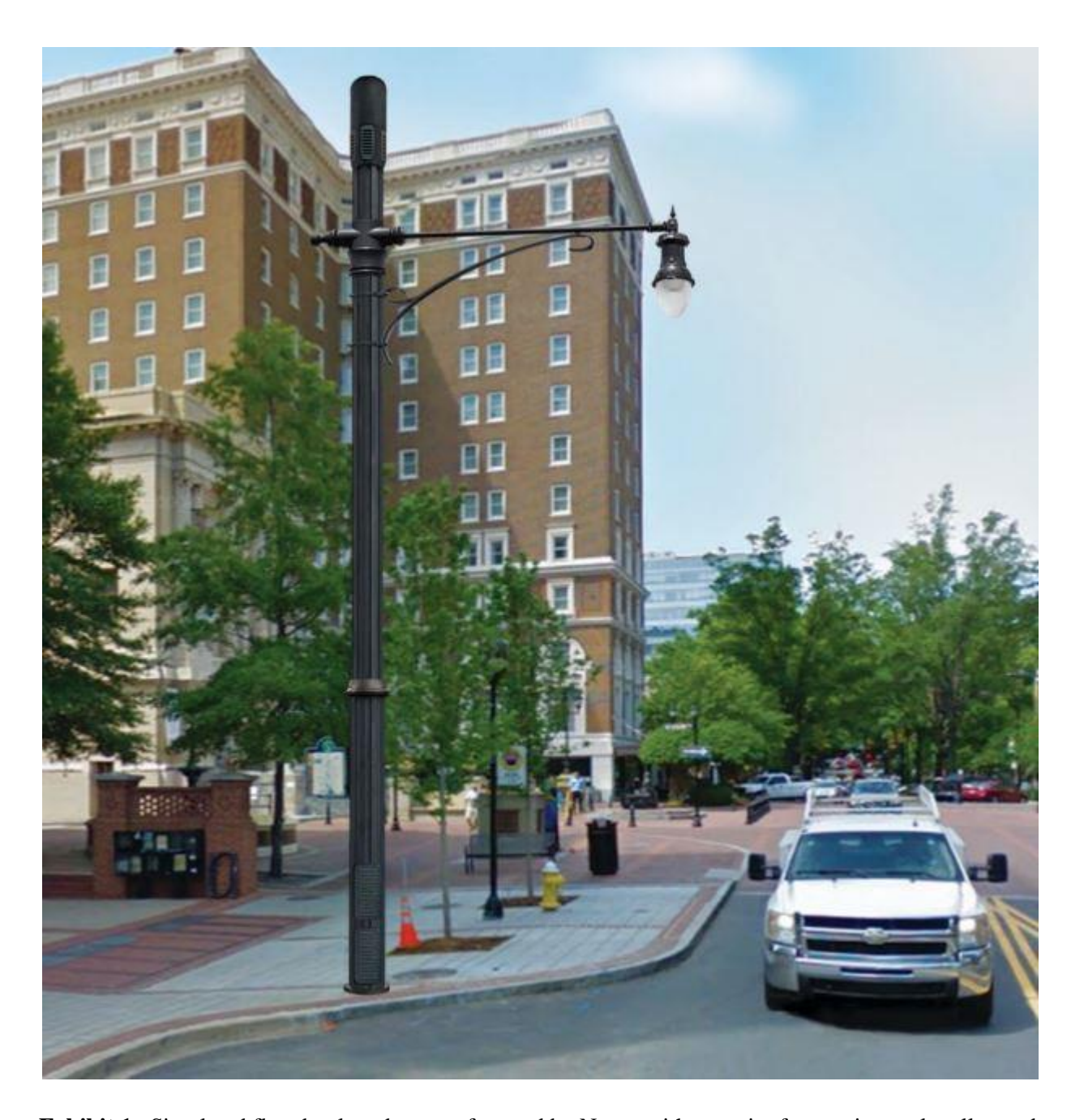
Exhibit 1. Simulated fluted pole to be manufactured by Nepsa with capacity for two internal, collocated wireless antennas. Decorative mast arm and down lighting luminaire by Sternberg Lighting, the manufacturer of the City's decorative lights. This would be an acceptable design with an arm that matched the design of the City's existing decorative lights; however, the pole's location, mere inches from the curb, would violate the 8 foot clear space requirement from the curb or edge of pavement. The light pole design may also be acceptable on certain streets with double mast arms matching the design of the City's existing decorative lights and down lighting luminaires by Sternberg mirroring one other.