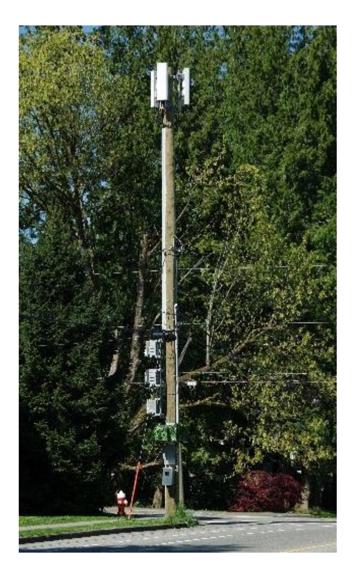
Exhibit 10. Wooden poles are prohibited. The City is transitioning away from wooden poles. In addition, the top-mounted antennas extend on arms away from the pole. This design is prohibited.